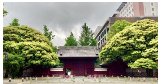
Hongo Campus, The University of Tokyo

The workshop will feature both oral and poster sessions. While we strongly encourage participants to join us in-person in Tokyo, a hybrid format with the option to connect remotely is foreseen.