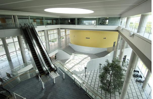
Tsukuba International Congress Center