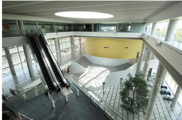
Tsukuba International Congress Center